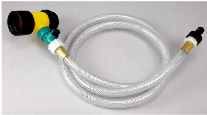
Photo below shows a Scotty 4000-BP, Hand Pump & 5 Gallon Back Pack

All components of the system are made from glass-filled nylon or PVC and are impervious to corrosion. For connection to NHT pump outlets and hoses, order 4002FILL-NHT. For use to NPSH pump outlets, order 4002FILL-NPSH.